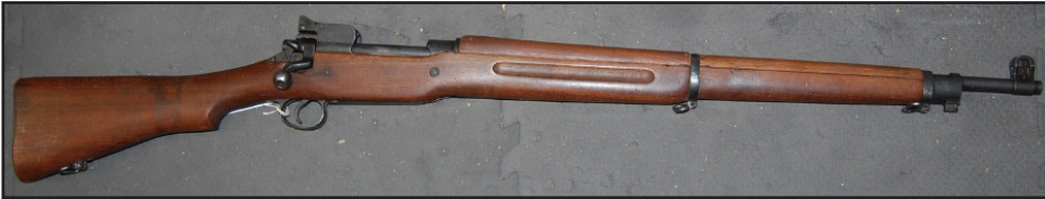
1917 U.S. Enfield

The course of fire for the event shall be: (5) rounds of slow fire in the prone position for sight-in within 5 minutes. For score; (10) rounds slow fire in the prone position, (10) rounds of rapid fire in the prone position, (10) rounds rapid fire in the sitting position and (10) rounds of slow fire in the standing unsupported position. For the Slow fire portion single fed rounds are fired within 8 minutes, while rapid fire is within 80 seconds with a magazine or stripper clip change. There will be a short safety briefing prior to the match. Please Note: You need not be a military member to compete, as they are surely welcome, you only need to own a military style rifle. For further information or questions contact Dave Vandermark at rifle@TCSL.org .