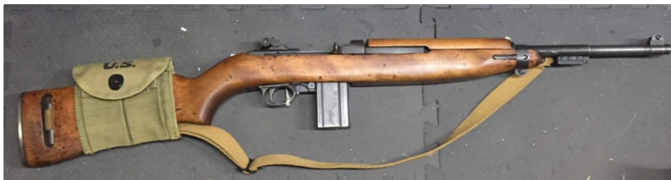
U.S. M1 Carbine