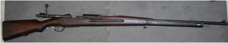
1903 Siamese Mauser