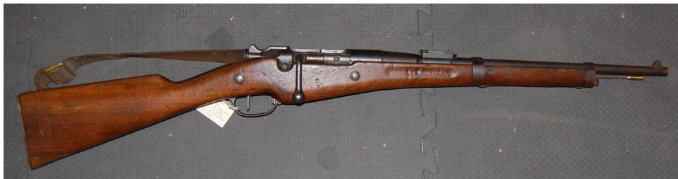
Mle 1892 French Berthier Mousqueton