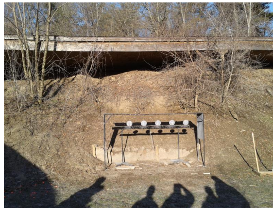
Trees growing out of berm