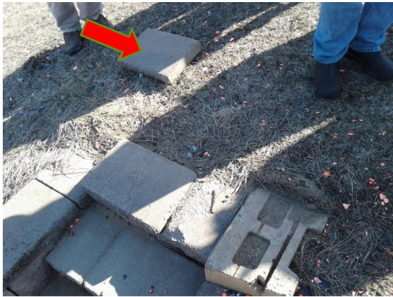
Trap house steps