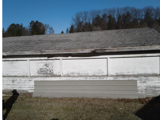
Concession stand repair or replace