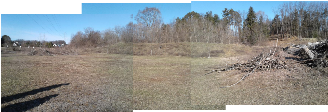
Turkey Shoot Area