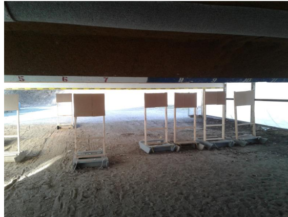
Correct Height of backers