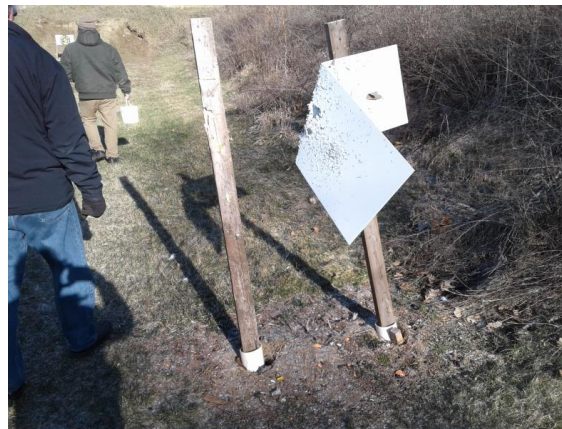
25 yd Rifle targets at rifle range