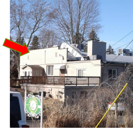
Sign over vestibule?