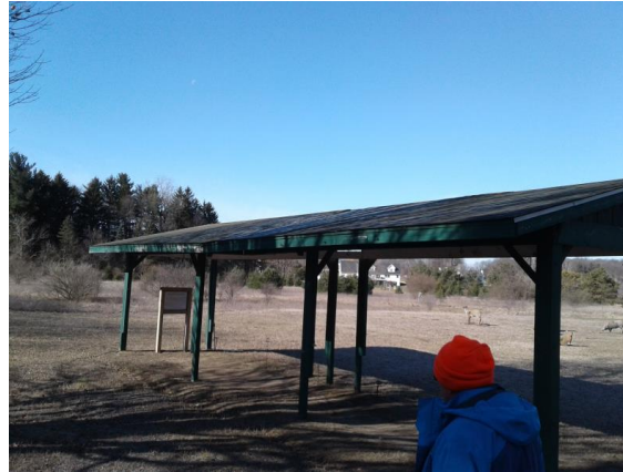
Needs a bench