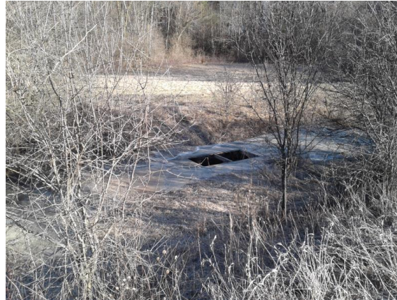
Damaged section of Creek Cover