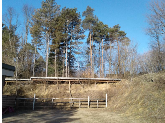
Neighbor structures in sight