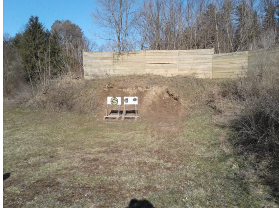
50 yd rifle target stands/berm