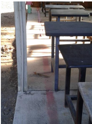
Firing Line on 100 yd Rifle faded