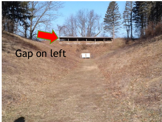
Target stand on extended Rifle Range