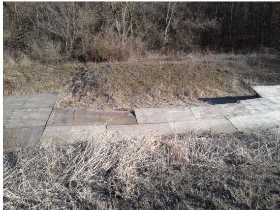
Damaged sections of Creek Cover