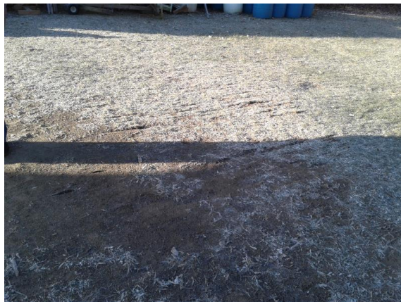
Skips at 25yds on pistol range