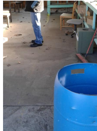
Safety Line on 100 yd Rifle faded