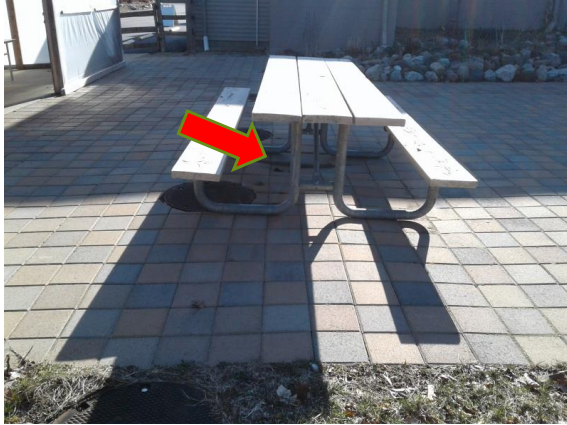
Sink hole under bench