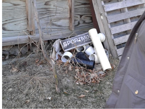
Trash behind grill