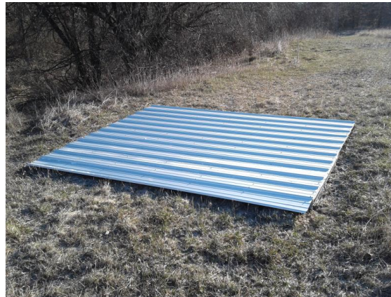
Sample of new creek cover section