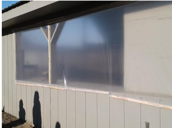
Barn doors planned 100 yd Rifle