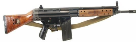
Fig 2 CETME 308